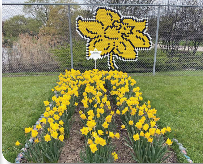
Daffodil Memorial Garden.