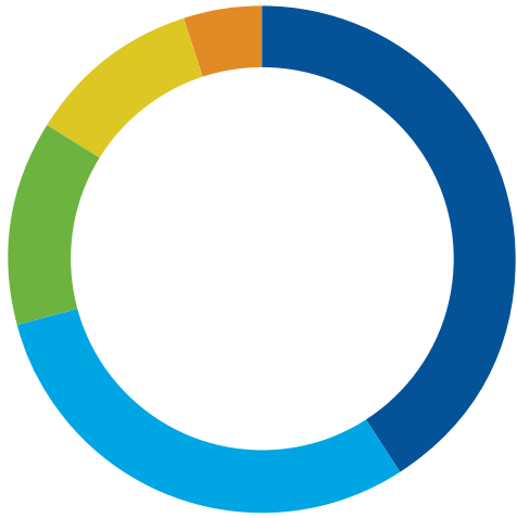
Total income in millions $50.4