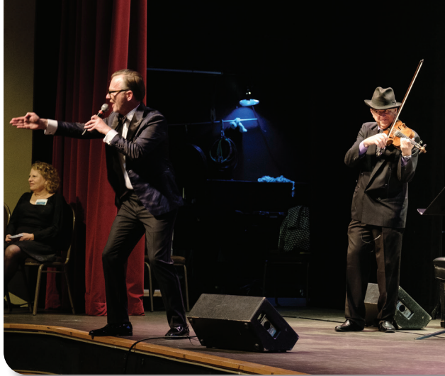
Celebrate CJE at the North Shore Center for the Performing Arts.