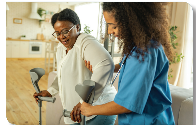
Dementia Reality™ trains caregivers to relate and care for adults with dementia with enhanced empathy.

Dementia Reality™: In 2022, CJE partnered with Elderwerks Educational Services to develop Dementia Reality™, which was generously funded by the Foglia Foundation. Dementia Reality™ is an innovative, unique, and creative way to train caregivers to relate and care for adults with dementia with enhanced empathy. It combines skills training with real-life obstacles in a virtual environment. This past year, we updated our curriculum and the format in which it is taught. The program is available and we are accepting registrations. For more information, please visit dementiareality.org .