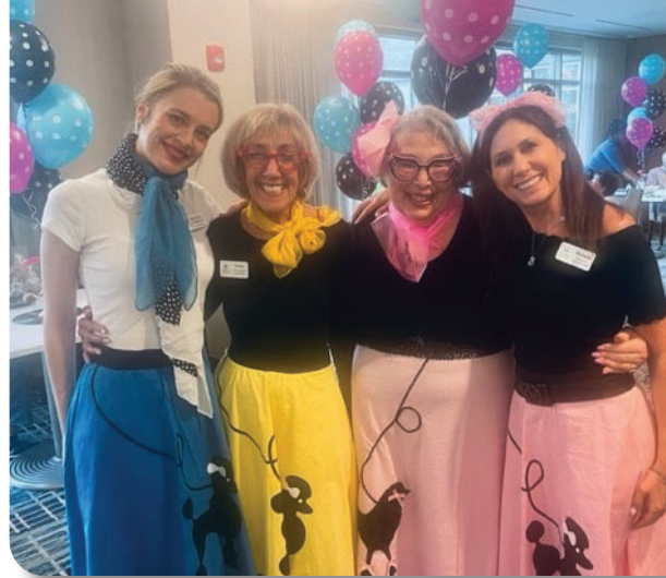
Tamarisk's third anniversary celebration.