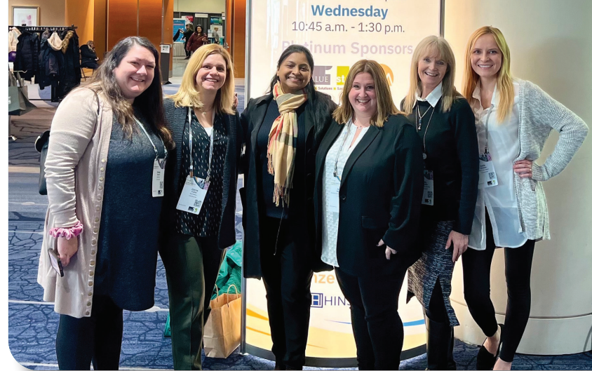
CJE at LeadingAge Illinois 2023.