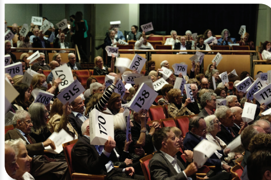
CJE's Board (left) and full auditorium (above) of CJE's supporters at Celebrate CJE.