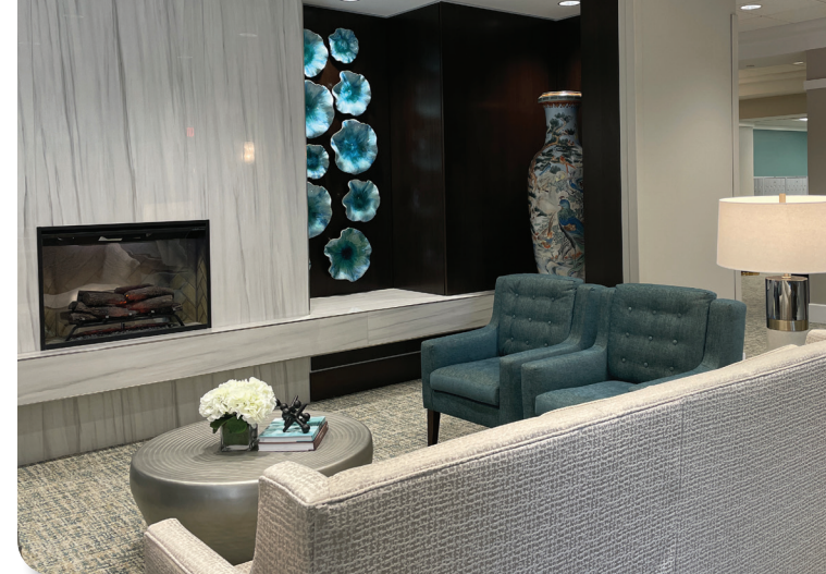
Gidwitz Place renovation.

Affordable Housing: CJE SeniorLife maintains four affordable housing communities, Krasnow Residence, Robineau Residence, Village Center, and Swartzberg House. Residents in these communities enjoy a relaxed lifestyle with ready access to necessary services, and engage in activities in a safe setting. Our four buildings on Chicago's north side and in Skokie each feature an on-site manager, maintenance staff, social service coordinators, and activity staff, of which several are fluent in Russian. They organize our holiday events, and plan frequent outings for our residents, including visits to museums, sporting events, and community presentations.