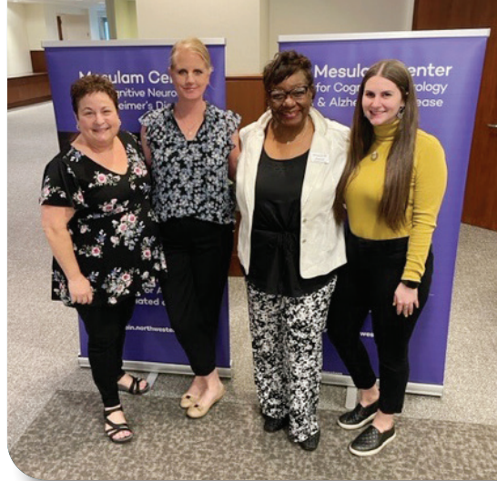
CJE at Northwestern University's 29th Annual Alzheimer Day.